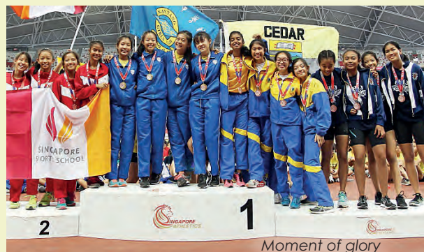
Moment of glory

Track and Field is more than just winning medals and it is definitely about the process, about the attitude that comes after each race and the experience. It's been an incredible journey competing for NYGH with the support of the school, peers and family. Four years in the sport has certainly been arduous, but they have been nothing short of "fulfilling".