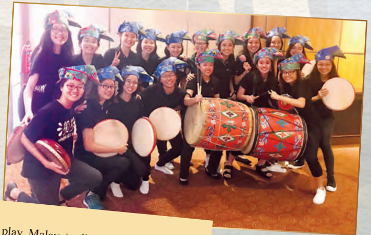
NYGH MSP students performing the traditional Malay gendang and kompong as part of a cultural showcase.

Acara ini telah dianjurkan oleh Sekolah Menengah Zhenghua untuk sekolah-sekolah kelompok CW6. Tema bagi acara tahun ini adalah 'Inilah Warisan Kita!'. Pelajar-pelajar daripada pelbagai sekolah yang terlibat telah mengadakan persembahan seperti tarian tradisional Melayu, persembahan kompong dan juga nyanyian. Pelajar-pelajar Menengah 4 Bahasa Melayu (Program Khas) juga telah membuat satu persembahan gendang dan kompong tradisional Melayu setelah menjalani satu program pengayaan budaya di sekolah.